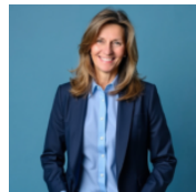
Gail Adashun Jones, Inc.