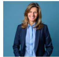
Gail Adashun Jones, Inc.