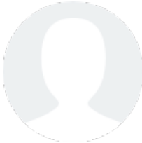
Chad Dallaire Realty