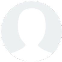
Nicole Cardinal Realty, LLC