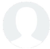
Thomas First Weber, Inc.