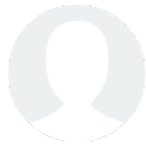
Robin First Weber, Inc.