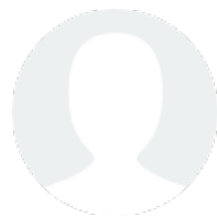
Jordan Beiser Realty, LLC