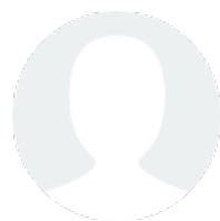
Andy Beiser Realty, LLC