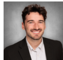
Ben Adashun Jones, Inc.