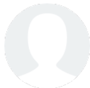
Brooke Adashun Jones, Inc.