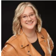
Laura Adashun Jones, Inc.