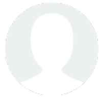
Josh Cypress Homes, Inc.