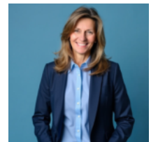
Gail Adashun Jones, Inc.