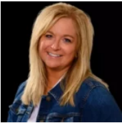
Colette Adashun Jones, Inc.