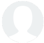
Jessica Design Realty