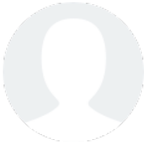
Nicole Cardinal Realty, LLC