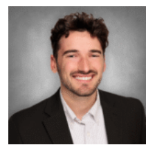
Ben Adashun Jones, Inc.