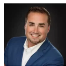
Kevin Adashun Jones, Inc.