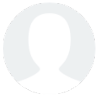
Robin First Weber, Inc.