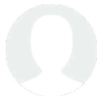
Tim Besaw Properties, Ltd