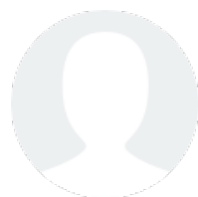
Tim Besaw Properties, Ltd