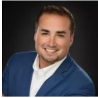
Kevin Adashun Jones, Inc.