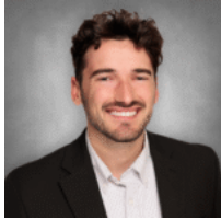
Ben Adashun Jones, Inc.