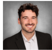
Ben Adashun Jones, Inc.