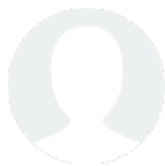
John First Weber, Inc.