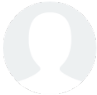
John First Weber, Inc.