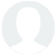
John First Weber, Inc.