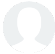
Mary Acre Realty, Ltd.