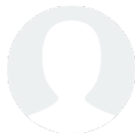
Melissa Acre Realty, Ltd.