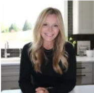
Kelly Adashun Jones, Inc.

BRAND NEW 2 BEDROOM, 1.5 BATH CONDO LOCATED IN EDEN FEATURES INCLUDE 1ST FLOOR LAUNDRY, OPEN CONCEPT WITH LARGE LIVING SPACE! ITS CORGEIOUS! STOP IN AND SEE