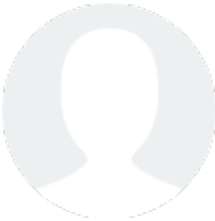
Vicky Beckman Properties