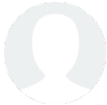
Mike Dallaire Realty