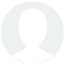
Stacey Acre Realty, Ltd.