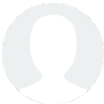
John O'Brien Real Estate