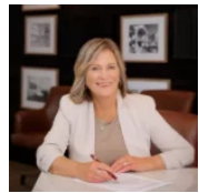
Jan Adashun Jones, Inc.