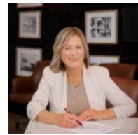
Jan Adashun Jones, Inc.