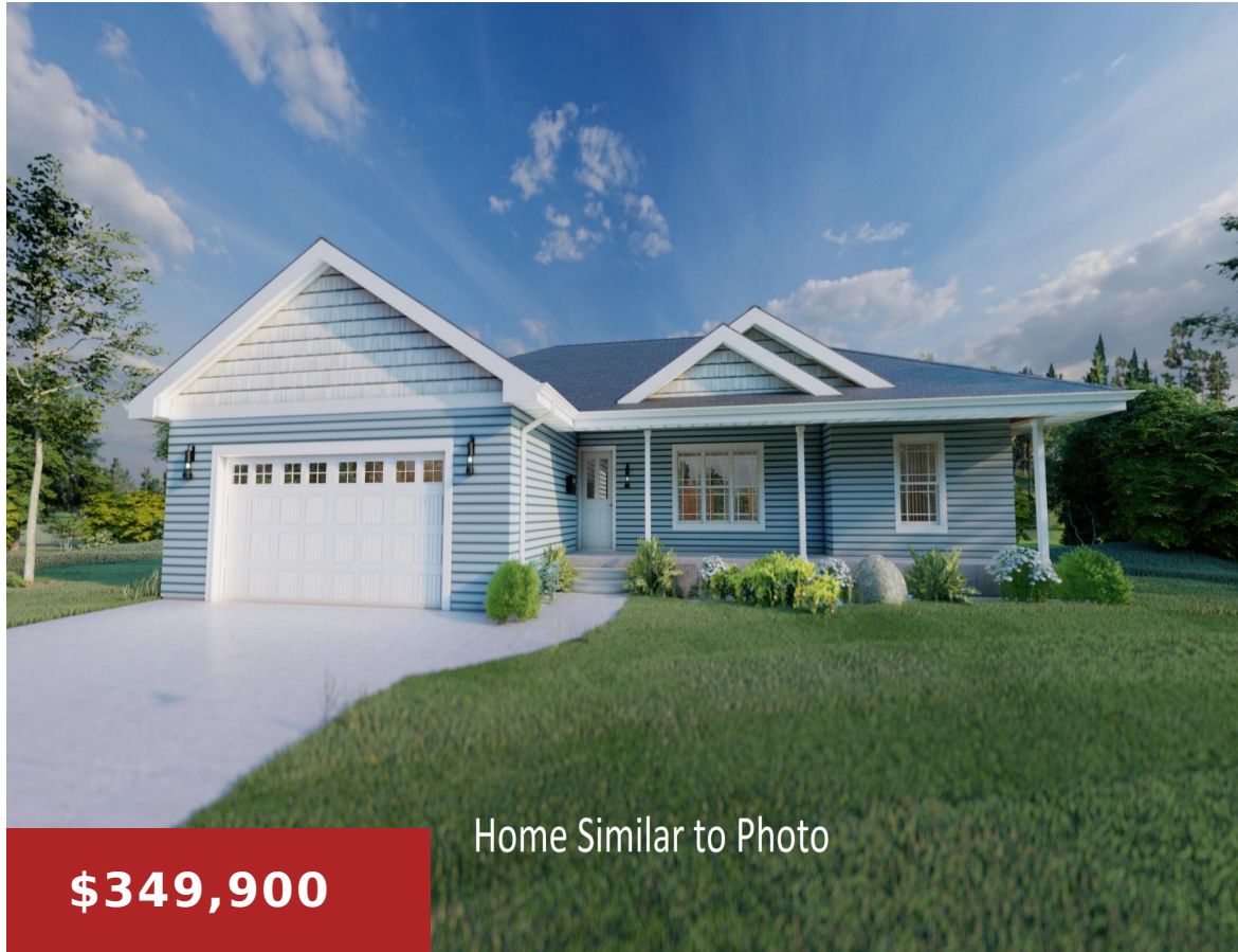
Home Similar to Photo

1011 CONSTELLATION Way, MARINETTE, WI, 54143