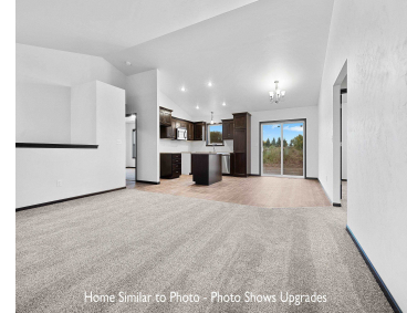
Home Similar to Photo - Photo Shows Upgrades