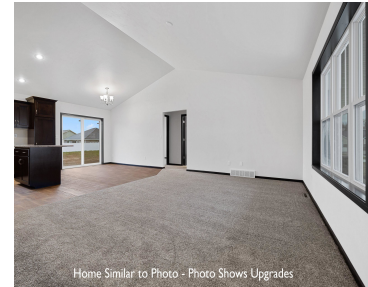
Home Similar to Photo - Photo Shows Upgrades