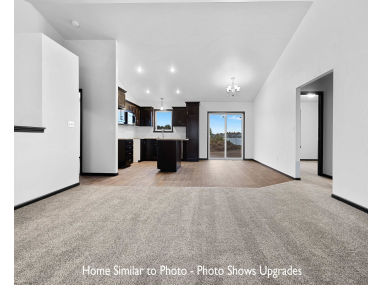
Home Similar to Photo - Photo Shows Upgrades