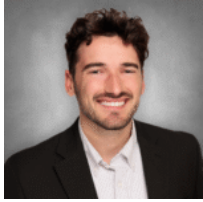
Ben Adashun Jones, Inc.