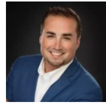
Kevin Adashun Jones, Inc.