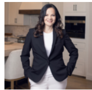
Sarah Adashun Jones, Inc.