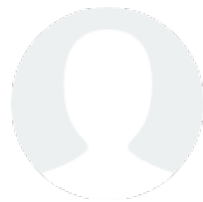
Tyler Beckman Properties