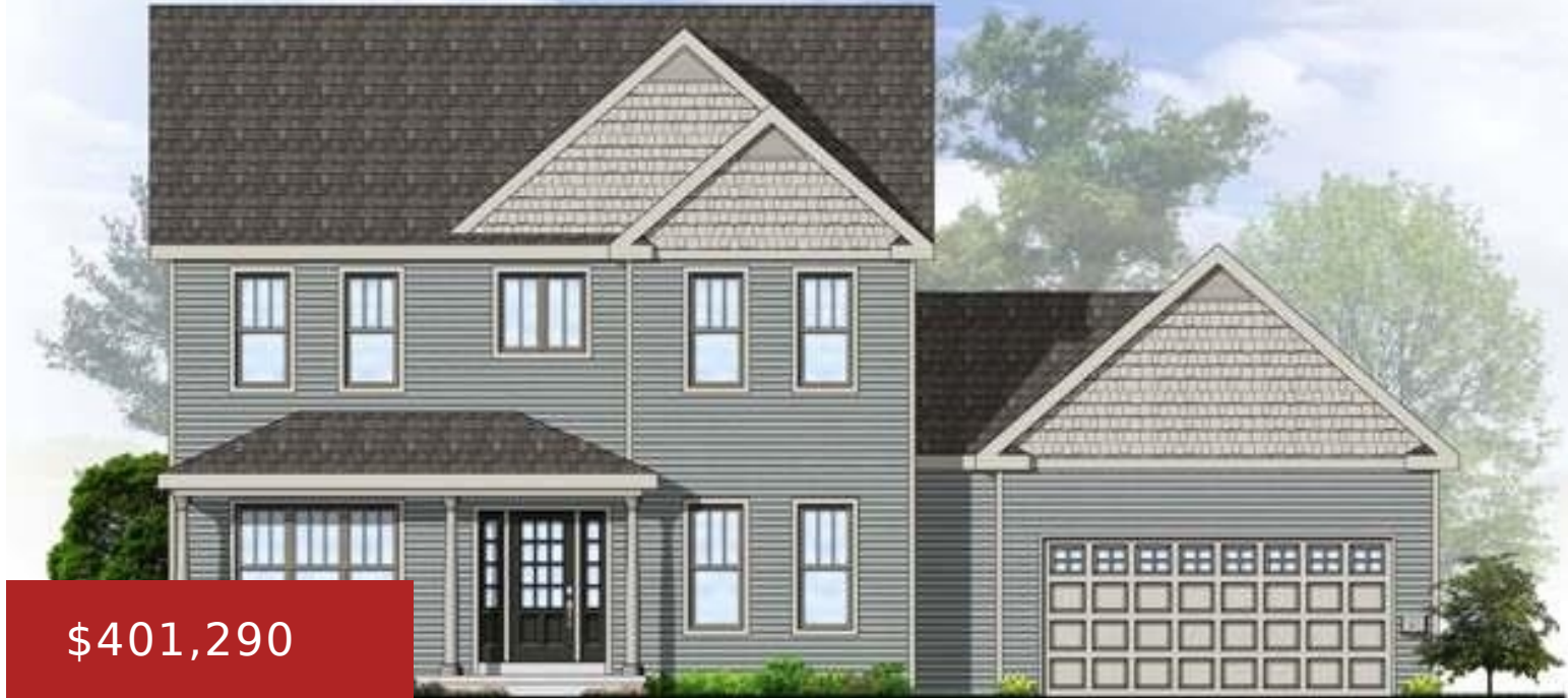
REPRESENTATIVE MODEL FOR COMPARISON

10 BELLINGRATH Court, Madison, WI, 53558